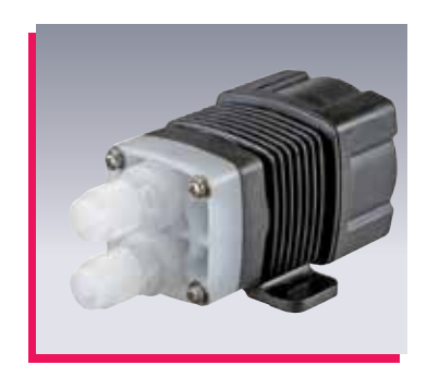
IWAKI is a world wide leading pump manufacturer. Our high quality, compact products, such as air, magnetic drive and metering pumps, are widely used in medical, laboratory and environmental control systems.